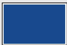
Spread 14 3 / 4 " x 10" non-bleed 15 3 / 4 " x 11" bleed